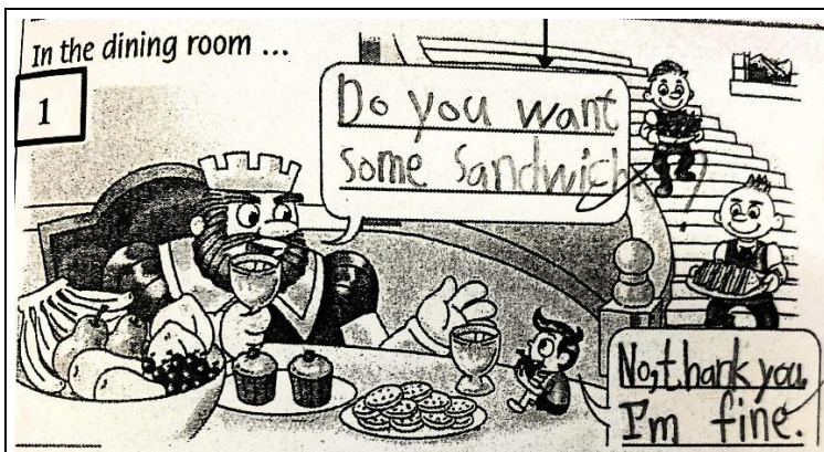
Ben and King Giant are in the dining room. They are eating and drinking.