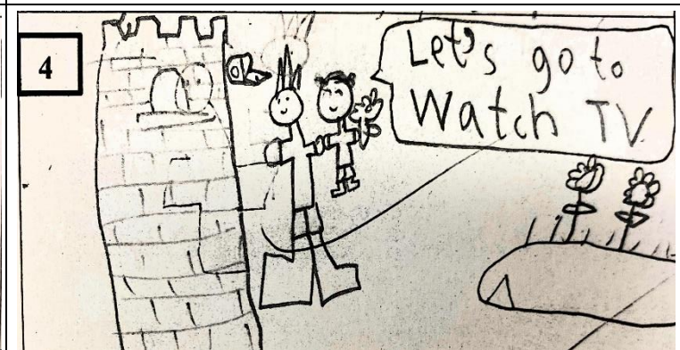
Ben and King Giant go back to the castle. They watch TV together.