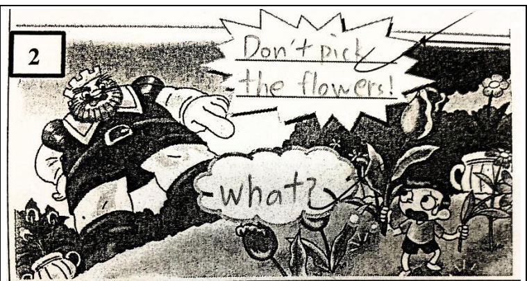
Ben picks the flowers from the garden. King Giant shouts at Ben. Ben is scared.